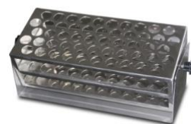
P8010 Test Tube Rack

Labwit quality assurance program demands the continuous assessment and improvement of all Labwit products. Information in this leaflet could thus change without notification and does not constitute a product specification. Please contact Labwit or their representatives if you require more details