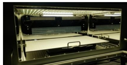
P5011WW: (100% Warm White)

*Fully customized color combinations are available, contact Labwit representatives for more information.