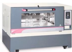
ZWYR-D2401 With P5010-35