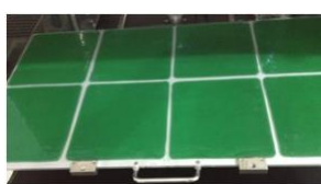
P8017 Sticky Mat