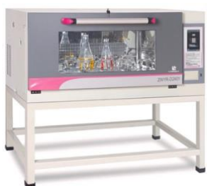
ZWYR-D2401 With P5010-50

This ZWYR-D Series shaking incubators can be stacked up to three units high, providing laboratory professionals tripled culture capacity, while still only occupying the same "footprint" of a single shaker. All models feature an insulated, fold-down door with double-layer glass window for high visibility. On all refrigerating models, microprocessor controller provides unmatched versatility by enable users to create personalized program (with up to 9 segments, with cycling) to automate changes to function parameters.