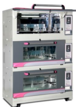
ZWYR-D2403 with P5017