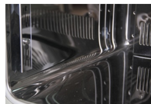
Coved Corner for Easy Cleaning

Labwit quality assurance program demands the continuous assessment and improvement of all Labwit products. Information in this leaflet could thus change without notification and does not constitute a product specification. Please contact Labwit or their representatives if you require more details