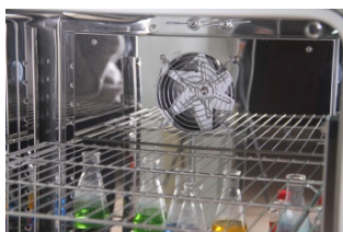
Motor Fan for Forced Air Circulations