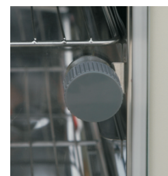
Inner Door Knob