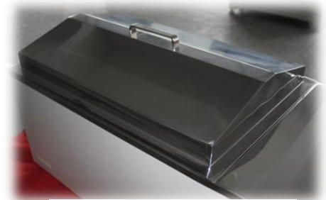
ZWY-110X30 (With Gable Lid)