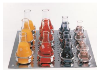
Tray and Clamps