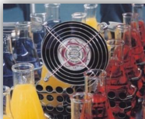
Forced Air Convection