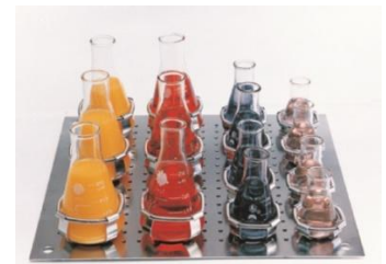
P6004 and Flasks