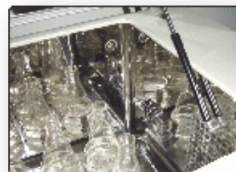
Stainless Steel Inner Chamber with Covered Corners Ensures Easy Cleaning

Advanced Solutions for Scientific Discovery!