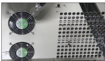
Forced Air Convection Deliver Excellent Temperature Uniformity