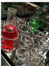
Quality #304 Stainless Steel Inner Chamber