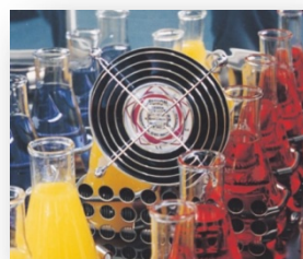
Forced Air Convection Delivers Excellent Temperature Uniformity