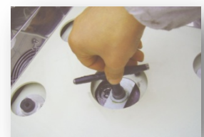
Stepless Shaking Diameter Adjustment