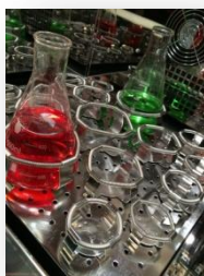
Quality #304 Stainless Steel Inner Chamber