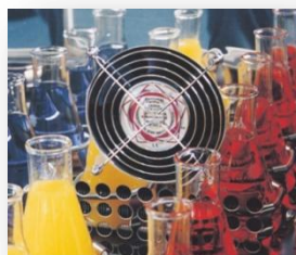
Forced Air Convection Delivers Excellent Temperature Uniformity