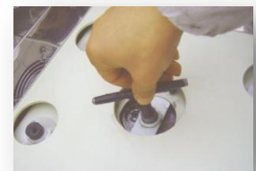
Stepless Shaking Diameter Adjustment